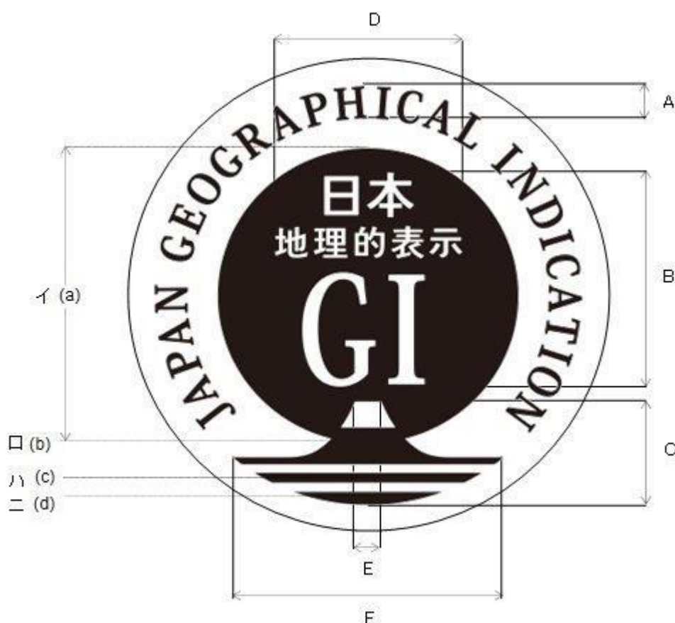
Form 6 (Related to Article 4)