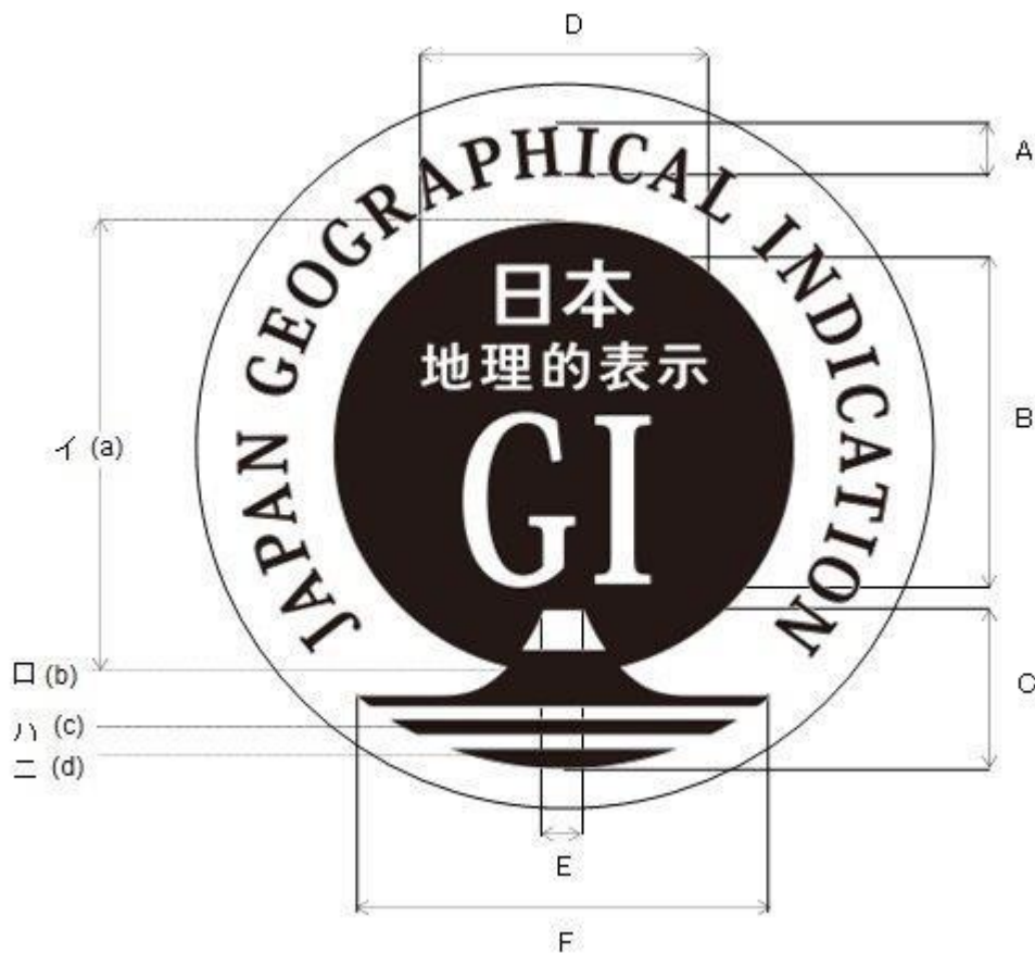
Form 3 (Related to Article 4)