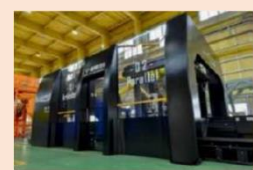
Example: High-efficiency resource circulation utilizing AI