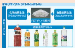
Example: Horizontal recycling of PET bottles