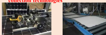
Example: Complete recycling of glass and metals Example: Recycling of used disposable diapers