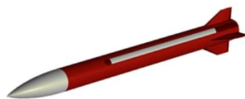
Warranty renewal for PAC-2GEM (Six-year contract) Estimated amount of cost reduction: 30.7 billion yen