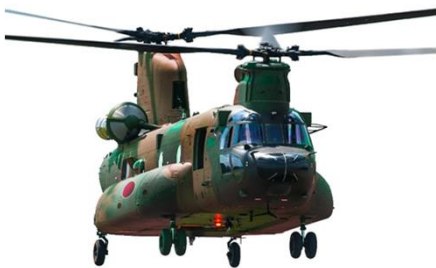
Purchase of CH-47J/JA (Eight-year contract) Estimated amount of cost reduction: 38.3 billion yen