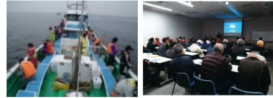
Number of casualties in the recreational fishing boat business